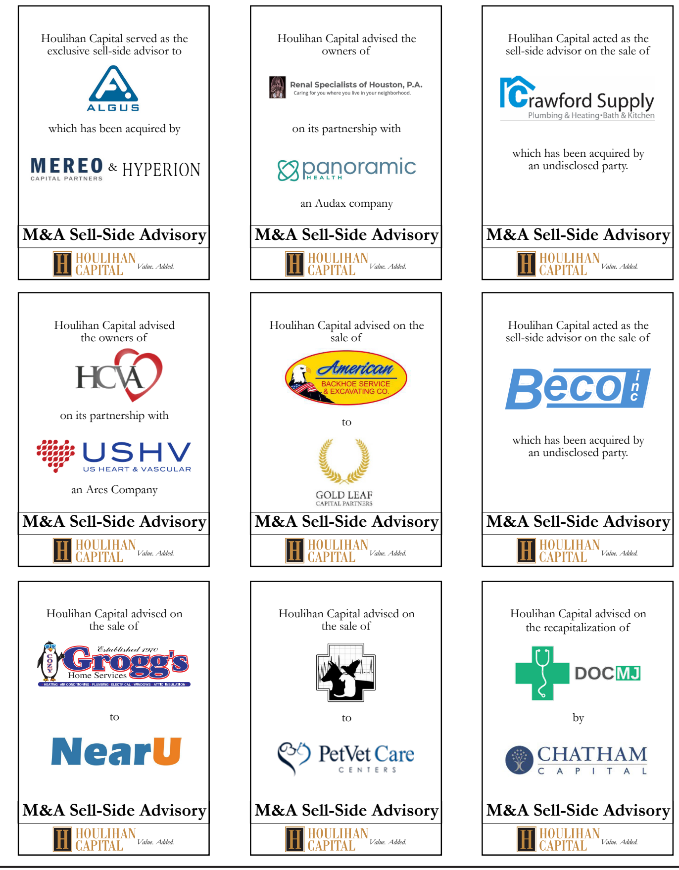
Member of FINRA | Member of SIPC www.houllihancapital.com

200 W. Madison Street, Suite 2150, Chicago, IL 60606 2400 Superior Ave E, 1st Floor, Cleveland, OH 44114